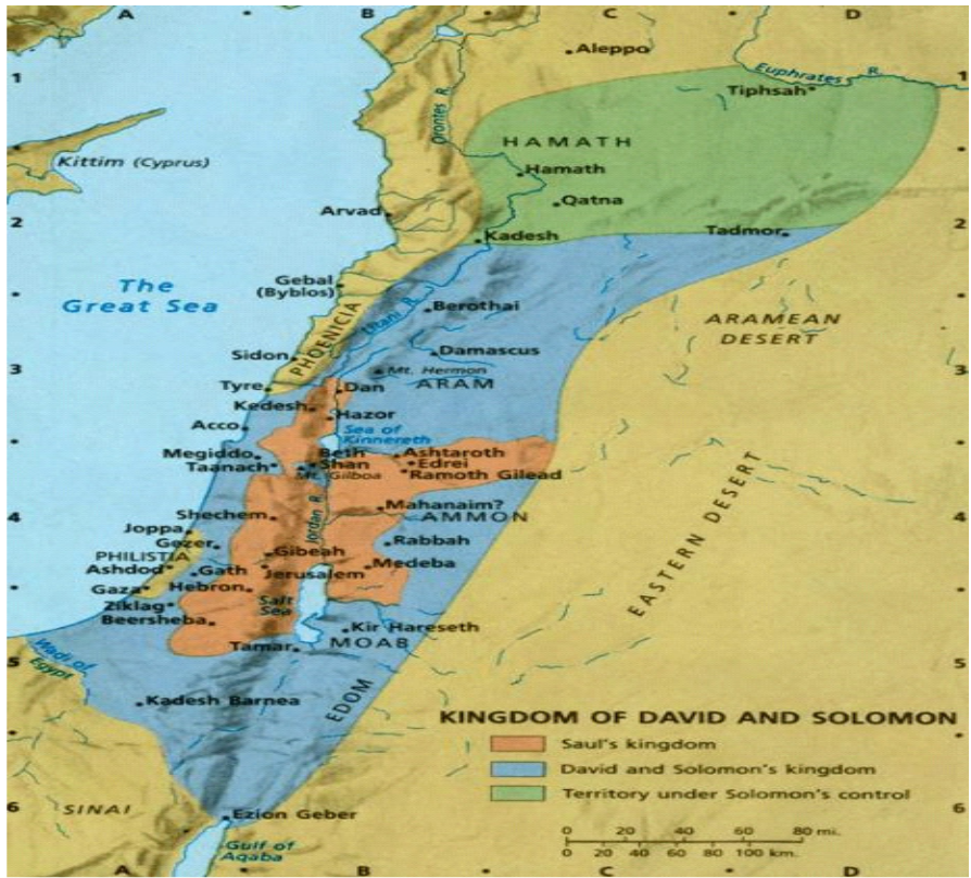
Mapu #3 Obwakabaka Obw'awamu