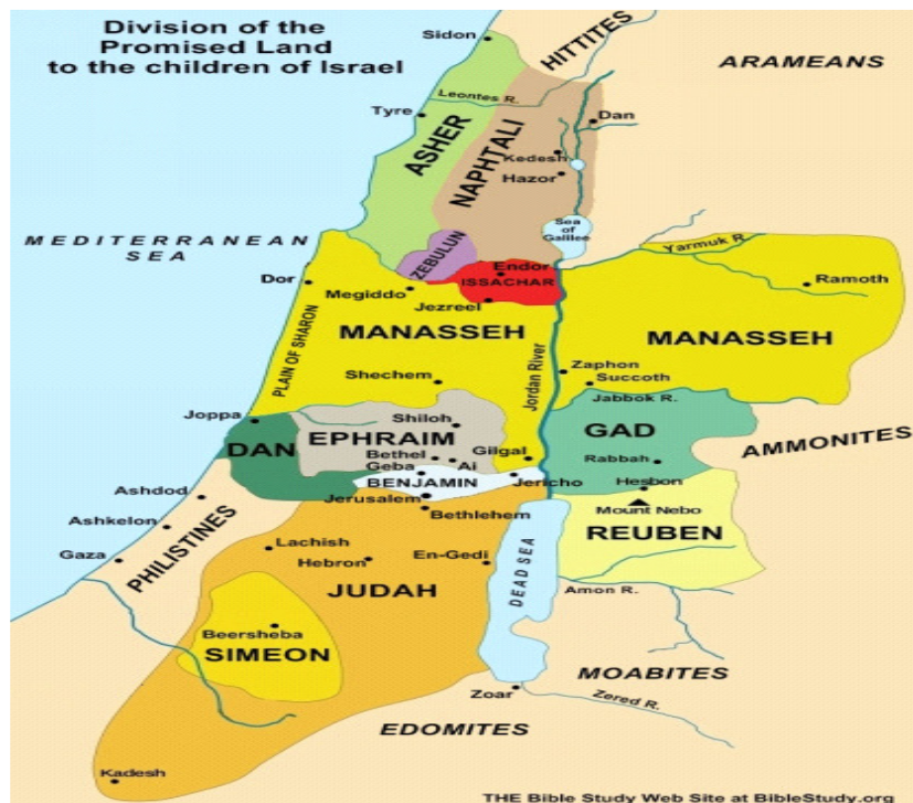
Mapu #2 Okuwamba n'Okutula mu Nsi