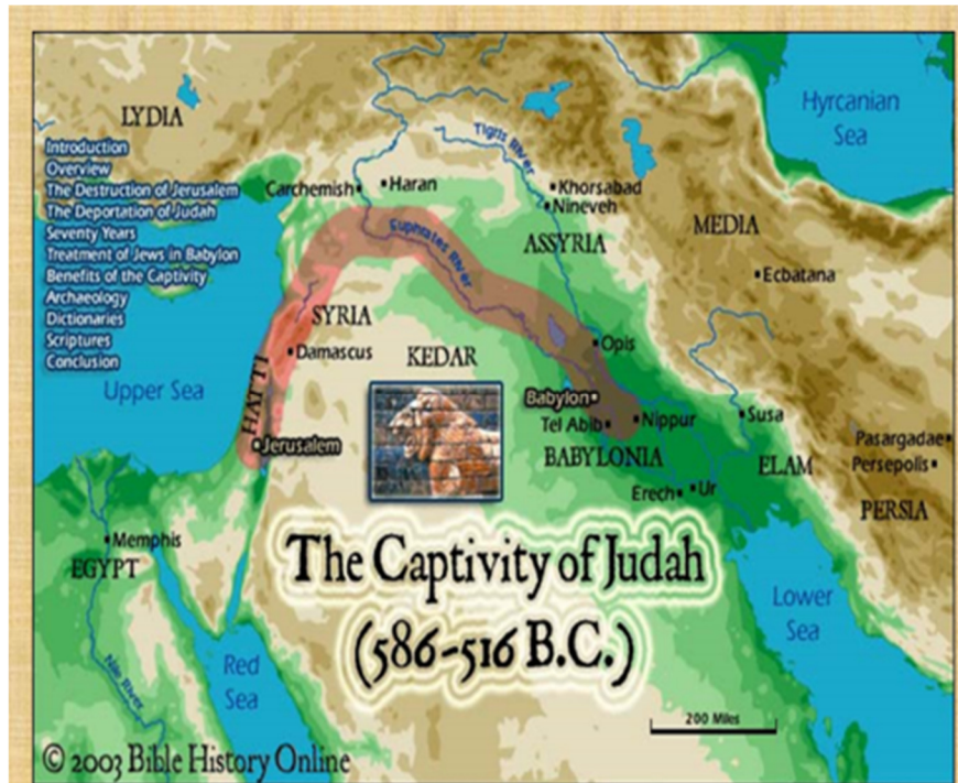
Map #5 Ekisera eky'obuwannganguse