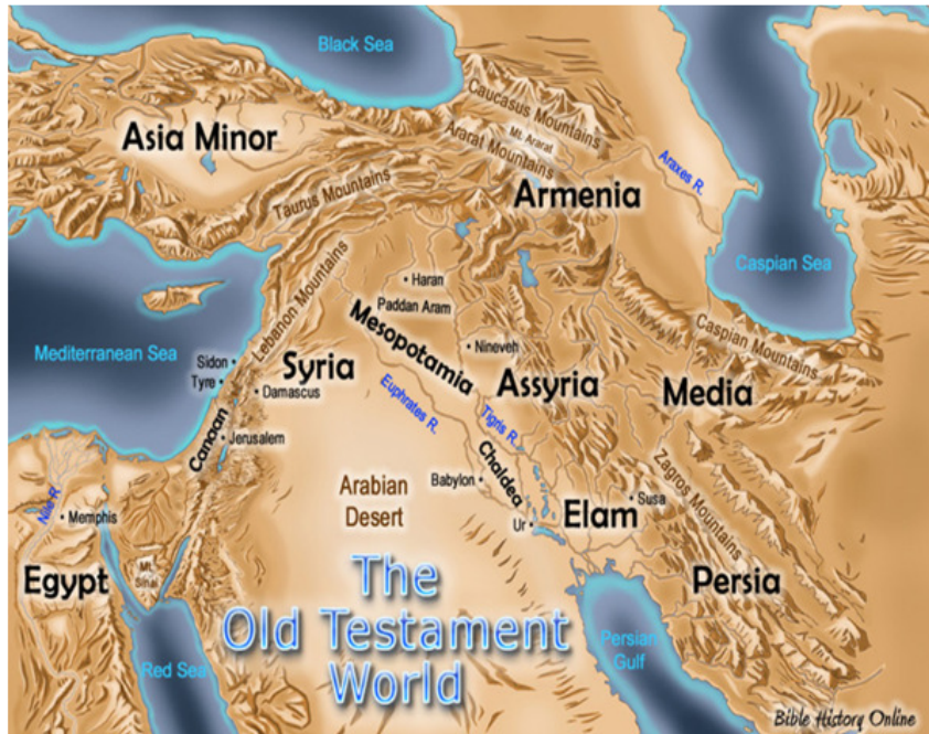
Mapu #1 Ensi y'Endagaano Enkadde