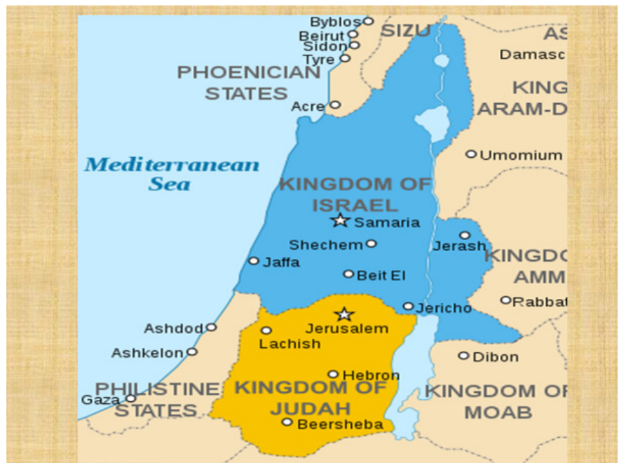
Mapu #4 Obwakabaka Obwawuddwamu